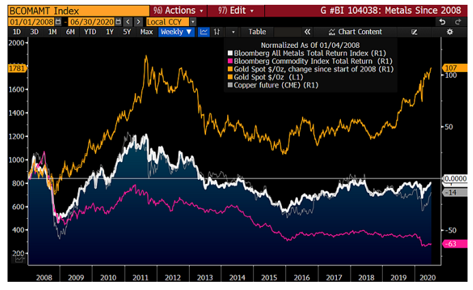
Gold Is Main Metals Driver vs. Broad Commodities

Less subject to the nuances of rolling futures and contango, yet benefiting from increasing demand due to rapidly advancing technology, the all-metals index appears poised to accelerate its outperformance of broad commodities. Strong gold is being offset by weak copper and base metals, keeping the sector relatively stable.