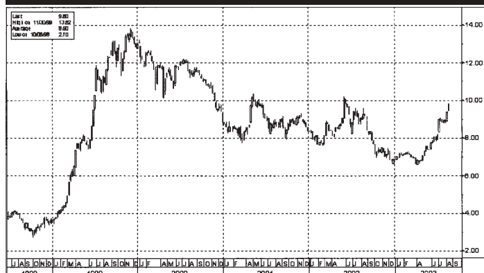
Merrill Lynch World Mining: 153.75p (Weekly)