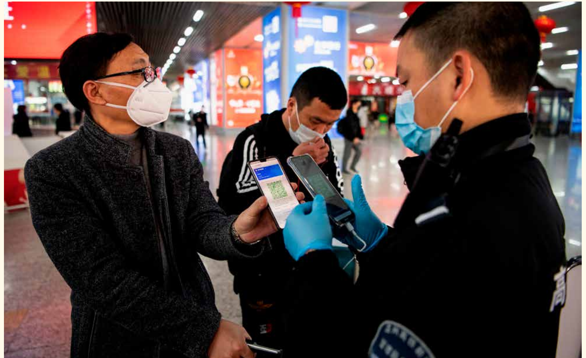
A passenger wearing a face mask as he shows a green QR code on his phone to show his health status to security upon arrival at Wenzhou railway station.

This debate on the trade-offs between data and privacy is now starting to occur in polities of every philosophical persuasion, and different societies and individuals will reach different conclusions. But these trade-offs do look very different when it is a question of life and death. I am struck by the degree of collaboration between companies which are commonly fierce rivals, such as Apple and Google, and also by the fact that size and reach matters hugely to the potential impact of such tracing technology. It seems to me that the very thing which was at the nub of many concerns surrounding these companies – namely their size – is now the potential route out of very strict long-term social distancing. The trade-off between privacy and utility will rage on, but it appears to me that, with this utility now encompassing life itself, many people’s previously strident views may well soften and the power of the large platforms will stand enhanced.