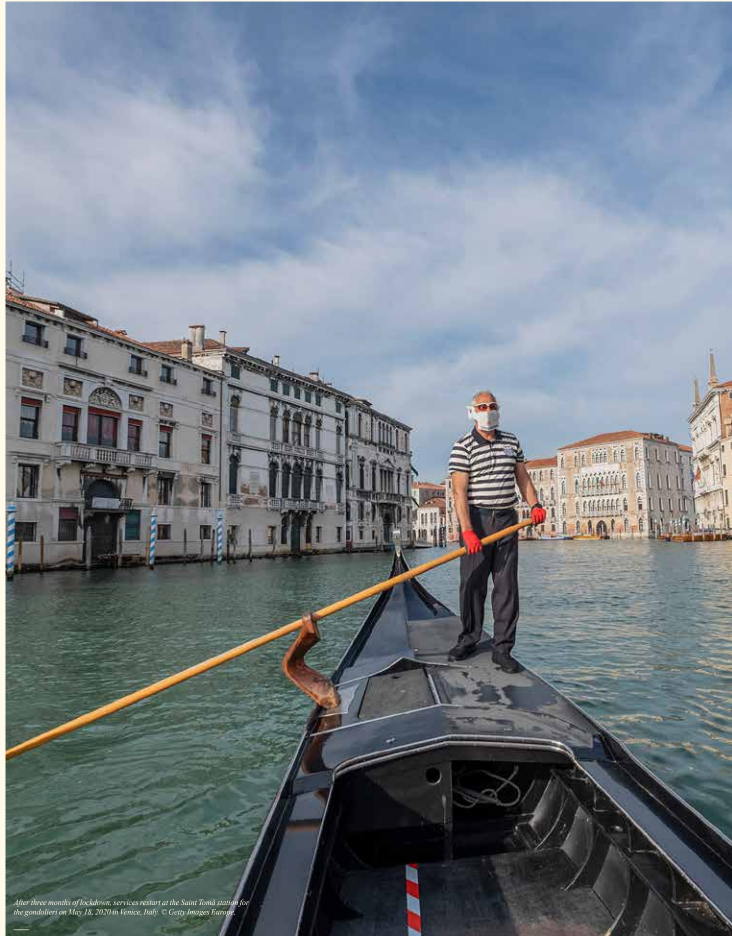
After three months of lockdown, services restart at the Saint Tomà station for the gondolieri on May 18, 2020 in Venice, Italy.