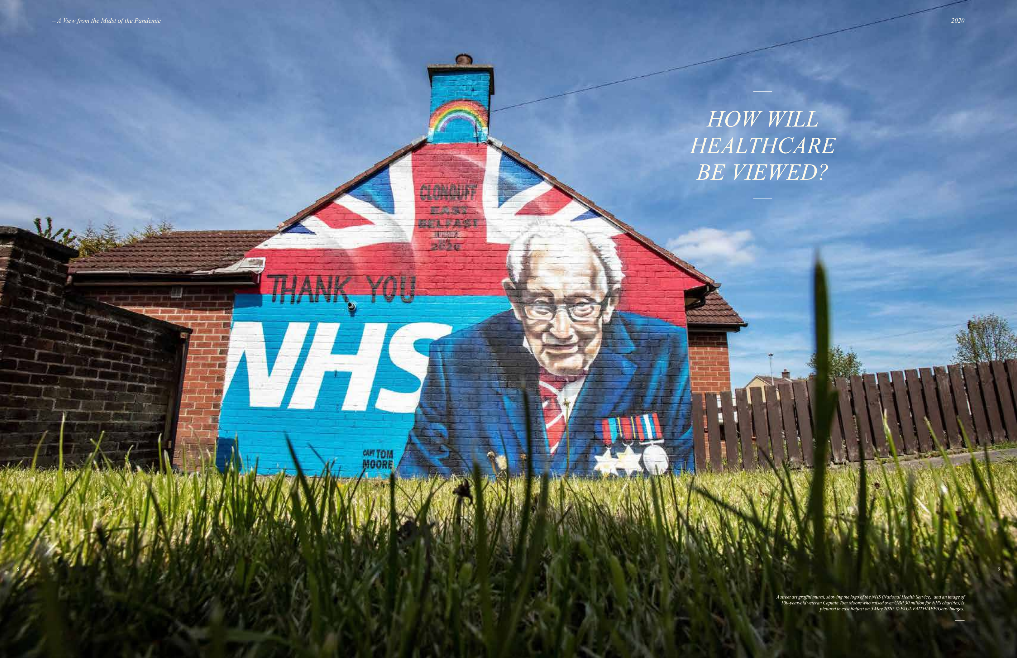
A street art graffiti mural, showing the logo of the NHS (National Health Service), and an image of 100-year-old veteran Captain Tom Moore who raised over GBP 30 million for NHS charities, is pictured in east Belfast on 5 May 2020.