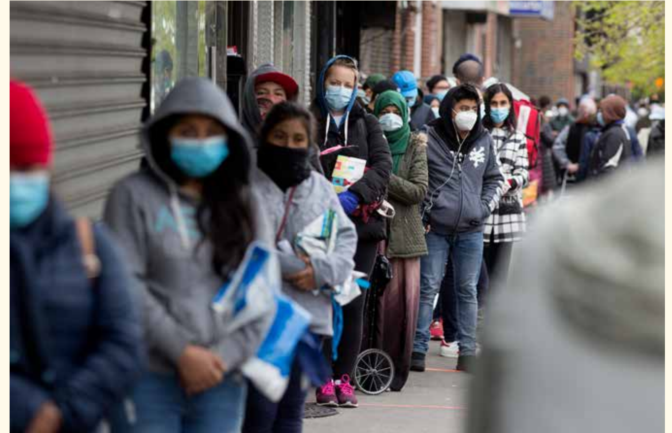
As unemployment claims continue to increase in New York City, the lines for free food continue to grow.

Of course, healthcare has always possessed the qualities of a public good and, in my experience, this has led it to behave differently when it comes to the quoted stock market. Indeed, much of the debate surrounding its outsize proportion of the US economy stems from that society's evolution of a public good as a primarily private enterprise. The challenges of dealing with the ageing populations of many societies and the trade-offs inevitably involved in deciding how much of the public purse should be directed toward healthcare will not diminish, but my sense is that both politicians and the public may well have a different answer to some of these conundrums going forward, whether it be toward public sector wages or investment in facilities. The US will remain a law unto itself, but no-one could have foreseen 30 million new jobless claims in little more than a month and the