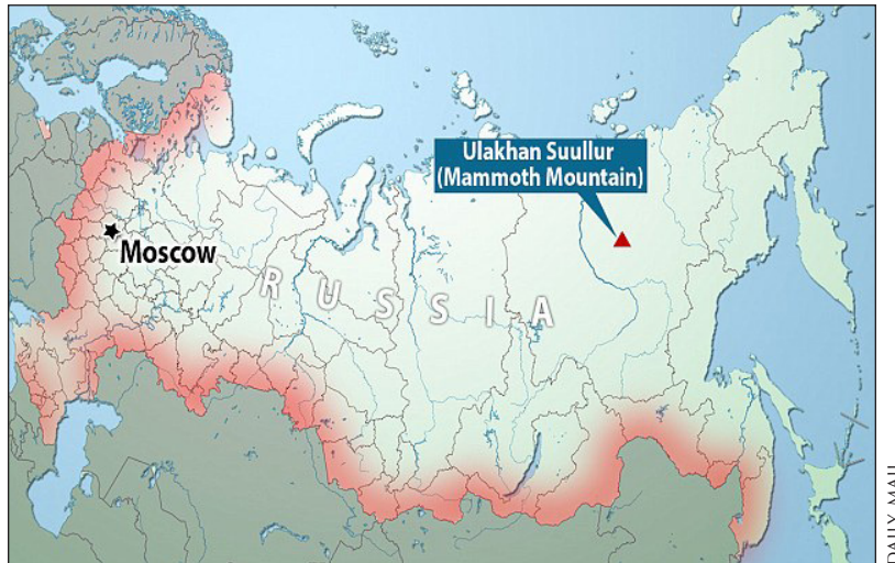
A bacteria thought to be 3.5 million years old was found in the Mammoth Mountain in Yakutia. Scientists hope that combining it with silver may allow poultry farmers to use fewer antibiotics.

Russian scientists have been experimenting with the bacteria for several years with the aim of learning how it has survived under such brutal conditions.