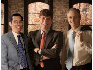
From right to left.