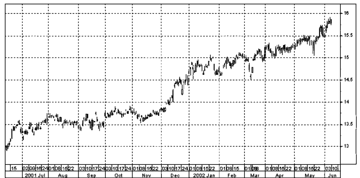
Euro/Yen: 117.85 (Daily)