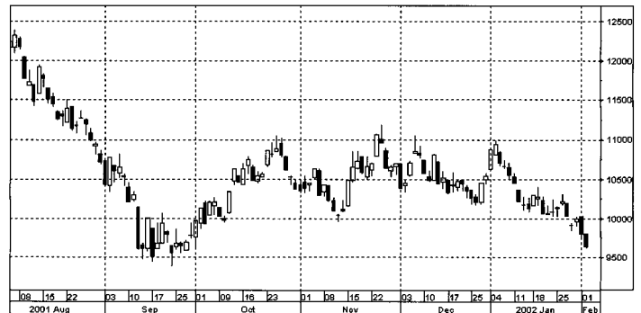
TSE 2nd Section Price Index: 1641.34 (Daily)